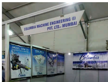
Andhra Pradesh Construction Expo, June '17 at Vijayawada, Andhra Pradesh