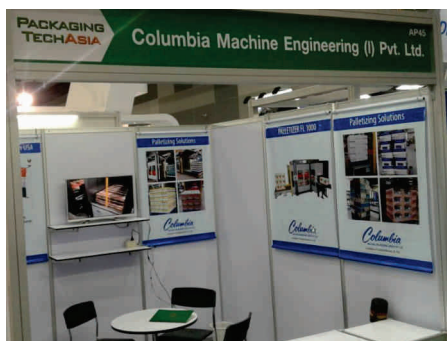
Propak Asia, June '17 at Bangkok, Thailand