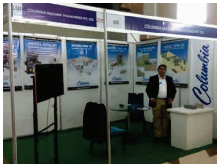
Bangladesh Buildcon International Expo, July '17 at Dhaka.