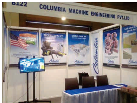
Buildexpo Africa, August '17 at Tanzania