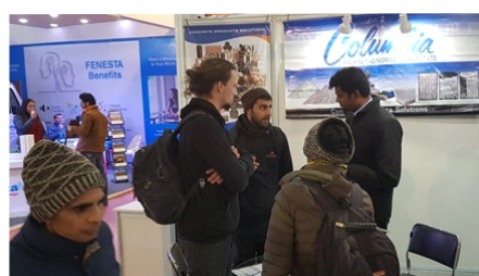
Nepal Buidleon, Feb'18 in Kathmandu