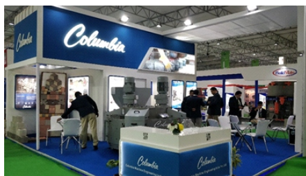
Bauma ConExpo, Dec'18 in Gurgaon